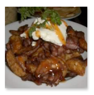
Wedges, bacon & cream

The Workman's Café Bar, 52 Broadway, Matamata. Opening hours 9am-10pm Wed-Sun, 3-10pm Tue-Sun