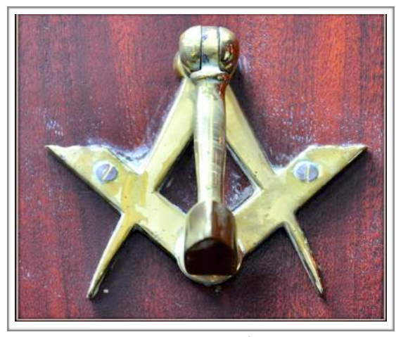
to guard our secrets from cowans