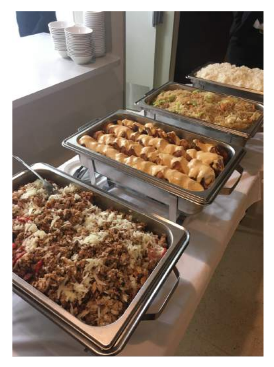
Fantastic Filipino dishes in the refractory