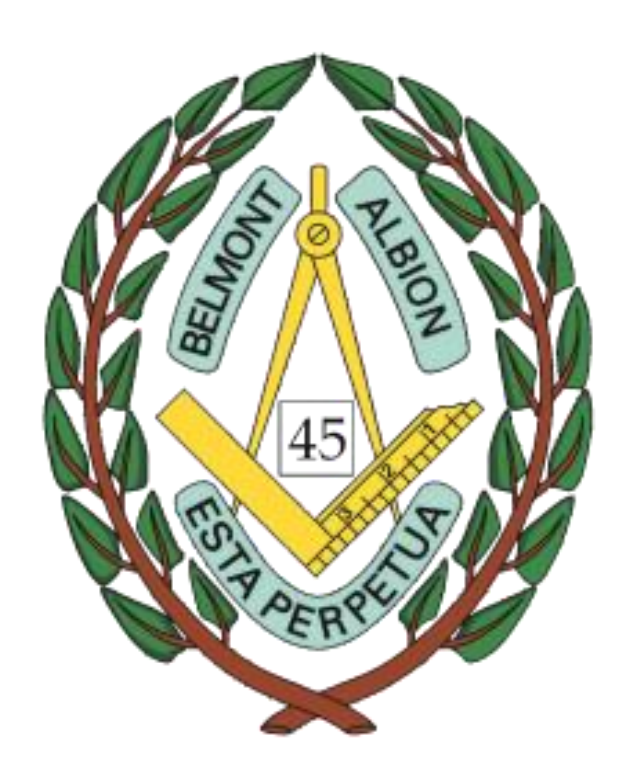
"I will strive to live with love and care, Upon the level and by the square"